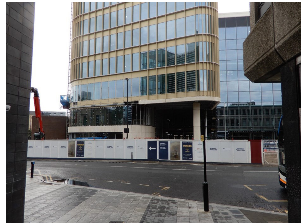
New HMRC Building, site of proposed Central Library Square, Newcastle Upon Tyne.

Literature during the COVID-19 period emphasised the significance of green spaces in city centres for people's physical and mental health. Library Square was therefore conceived as part of a network that included green spaces. While there is considerable greenery at the periphery of the city, it is important to bring it into the city centre as places of relaxation and respite. This will require a commitment by the local authority and central government to the community, including ongoing maintenance.