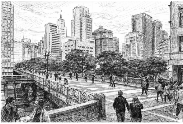
Urban Bridge, São Paulo.

Rendering by Ihab Elzeyadi based on mass media images.