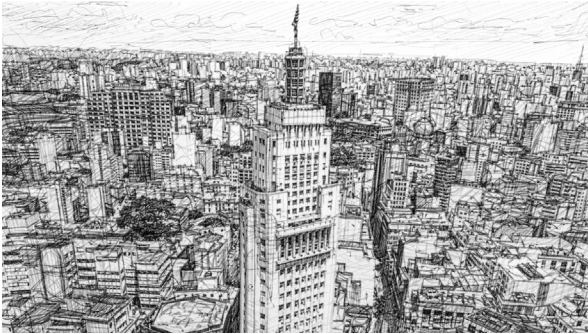
São Paulo Skyline.

São Paulo is the largest city in Brazil and South America. The metropolitan area of São Paulo, with its 24 million inhabitants, is one of the most populous in the Americas and the fifth largest in the world. São Paulo's city centre development occurred mainly between 1900 and 1980. Government agencies, office buildings, large shops, cultural spaces, and residential buildings were built, attracting people from all over the country and from abroad.