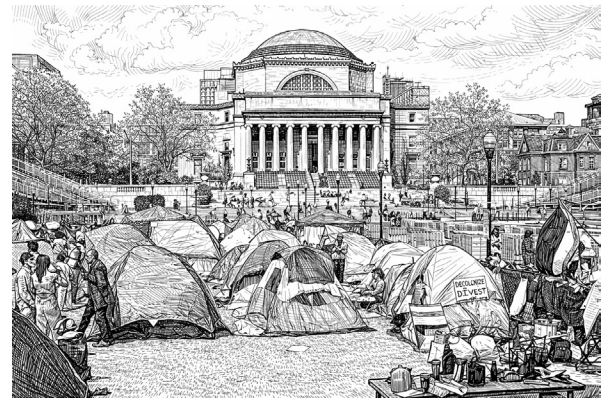
Columbia University encampment. Rendering by Ihab Elzeyadi based on mass media images.

Similarly, public areas and quadrangles on multiple US college campuses have been sites of demonstrations and political encampments by students and university staff to voice disagreements with US and college-campus policies. These public sites are used as spaces to make some student groups' demands more vocal and visible. They have also been sites of clashes with campus police, college administrators, and political far-right groups.