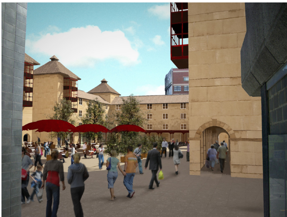
Proposed Central Library Square, Newcastle Upon Tyne. Rendering by Bob Giddings, 2010.

Concerned at the lack of public space for community use, researchers and practitioners provided designs for the re-use of this vacated land and property. Shown above is a square at the front of the new City Library. It includes premises for small local businesses and city centre housing. Microclimatic analysis demonstrates that external noise is reduced, as are wind speeds, while temperatures are increased to enable the extended use of the space.