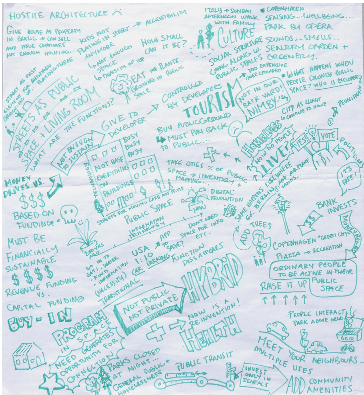
Drawing produced during the Spatial Equity and Inclusiveness Workshop at the EAAE-ARCC 2024 Conference by Cathryn John, 2024

To me the workshop opened my eyes to the large number of various aspects shaping the environments of today's cities. The conflict, the economy, the homeless etc. It interests me how local areas, squares, and streets together with local traditions (example: a Sunday afternoon walk with the family in Italy) build atmospheres for the people living there. How the people themselves organize and create the world surrounding them is possible as a way ahead. People can make the architecture live.