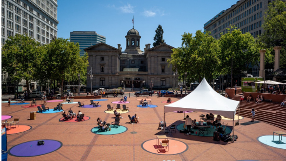
Pioneer Courthouse Square, Portland. COVID-19 Social distancing.

These accessible and affordable public places found new users and uses during the COVID-19 pandemic. They served as socially distanced gathering places, vaccination centres, public health check-up sites, as well as food supply pantries. These examples were great testimonials to the importance of flexible and accessible public spaces in the city centre that provide multiple uses and are open to different groups.