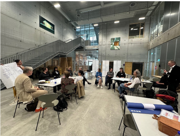
Spatial Equity and Inclusiveness Workshop at the EAAE-ARCC 2024 Conference.