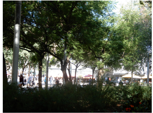
Plaça del Poeta Boscà, Barcelona. 2024.

are wind speeds, while temperatures are increased to enable the extended use of the space.