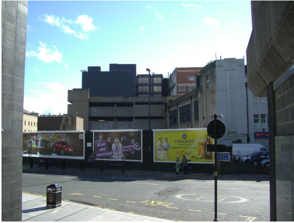
Site of proposed Central Library Square, Newcastle Upon Tyne.

Newcastle upon Tyne is the regional capital of North East England. Traditionally, land in the city centre has been owned by the citizens and administered on their behalf by the City Council. There has been incremental development, but by the end of the 20th century some areas had become intentionally neglected as leases for small businesses were not renewed, and property emptied. The local authority was setting up these areas for major redevelopment.