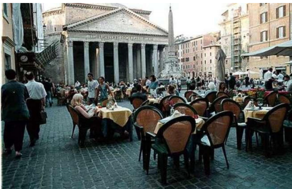
Piazza della Rotonda, Rome.

This open and accessible space can be subject to abuse as well. We have witnessed how commercial activities hijacked such spaces during the COVID-19 pandemic and established outdoor cafés and restaurants in them. This has turned the space – once open and free to public use – into a space that is used for commercial purposes, excluding those who cannot afford to use these commercial establishments.