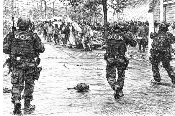
GOE Officers, São Paulo.

crack and other drug addicts, in an area known as Crackland. It started during the 1990s and is still ongoing. The existence of Crackland in the city centre has led to a feeling of insecurity and, most importantly, worsened the deterioration of public spaces in the area. Most people pass through only because of transportation needs, as the main public lines originate in the city centre.